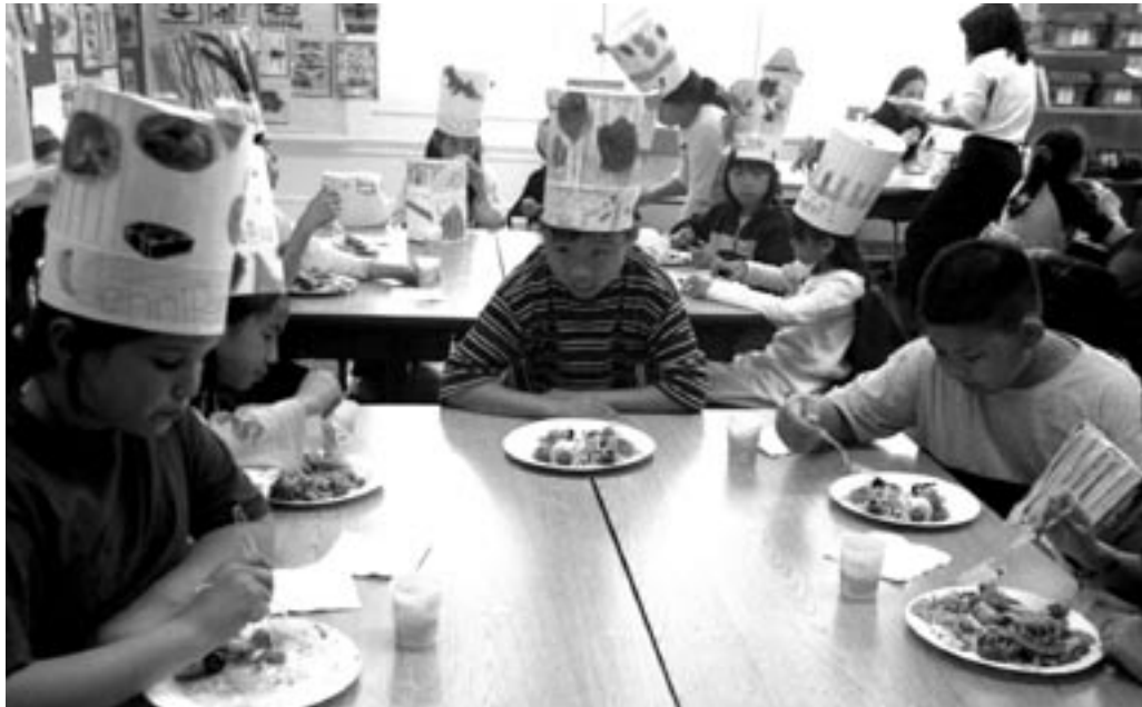
The students at Redding School eat the salads they made in the chef's hats they decorated themselves. A good time was had by all—and some learning, too!