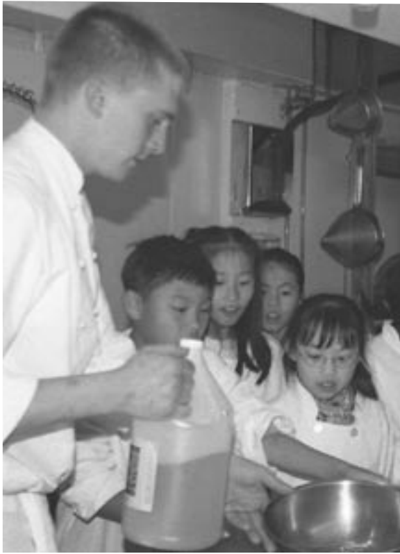
One of the chefs at Indigo Restaurant teaches the kids from Redding School how to make salad dressing the professional way.

of Taste after a French program called “Journee de Gout.” From there it spread to AIWF chapters across the country with the belief that taste and health go hand-in-hand. Days of Taste provides the AIWF with a vehicle to help shape the taste buds of future generations.